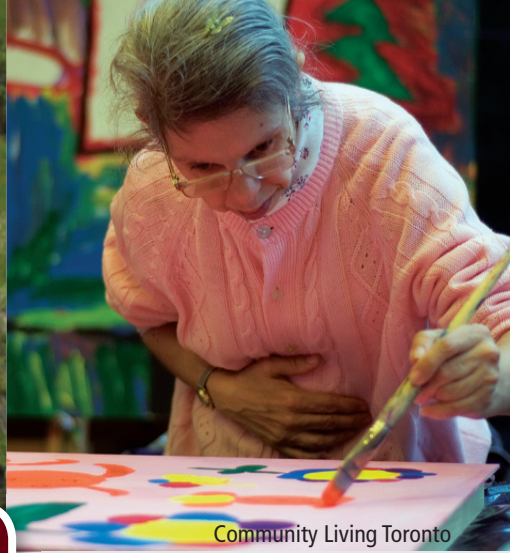
Community Living Toronto